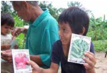
Children in Peru hold seed packets.

Seeds have been sent to Iraq, Afghanistan, Africa, Central and South America, and monetary donations have gone to International Affiliate GCs and to organizations to purchase seeds as a world gardening project. Continuing programs have been promoted to provide education on planting, ecology, and harvesting. Due to international regulations, it is difficult to mail seeds abroad and monetary donations are preferred.