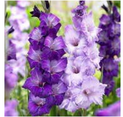
The early-flowering hybrid Gladiolus nanus may be planted outdoors in mild climates, where they are grown for cut flowers.

or sturdy perennials to help keep them upright. Grown from corms, these plants will thrive in ordinary cultivated garden ground without special preparation, but it is worthwhile taking pains to make the soil as suitable as possible for their needs. If the ground is clay, mix in compost, thoroughly decayed manure, and sand. By planting the corms at intervals of ten days and two weeks from the time the trees begin to leaf in spring until about two months before the first killing frost is expected, a long succession of blooms are assured.